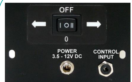
External Control Option Rear Panel